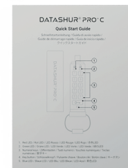
Quick Start Guide