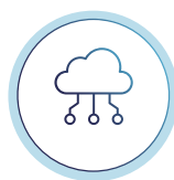
Managed Service Provider (MSP)