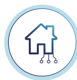
On-Premise Data Centre